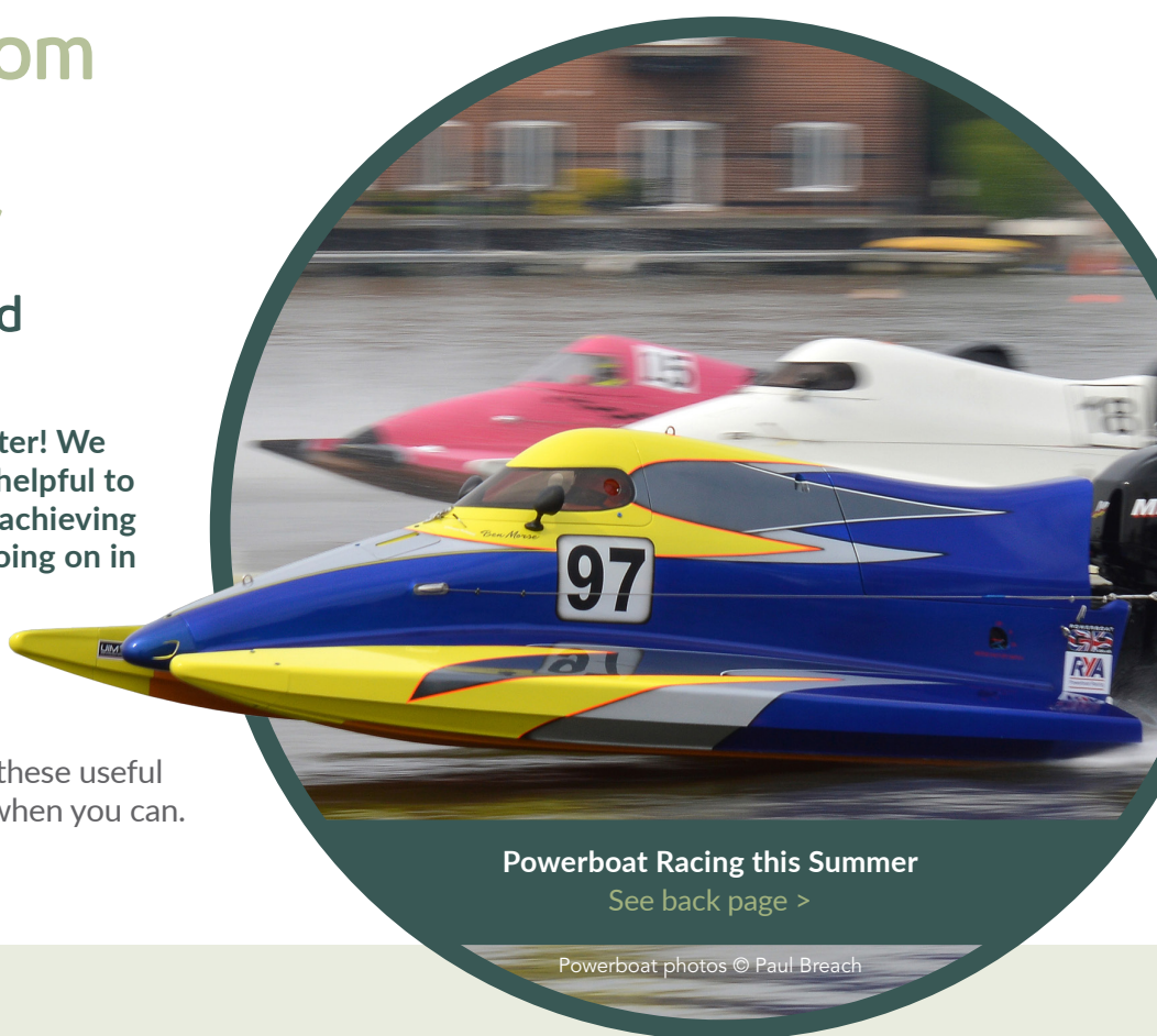
Powerboat Racing this Summer